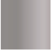
Matte White Lacquer - MWL